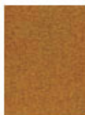
454 light brown DB