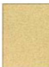
451/1 light tan