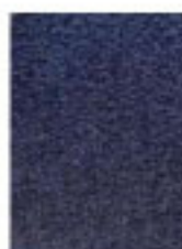
447B medium blue