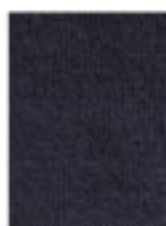
445A dark blue