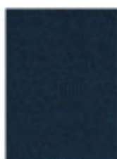
446 dark blue DB