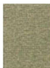
489 grey green