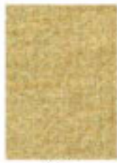
471 light tan