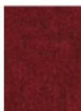
443B dark red DB