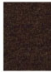
474 dark brown