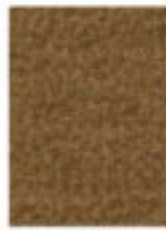
473 tan grey