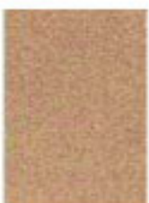
453/3 dark tan