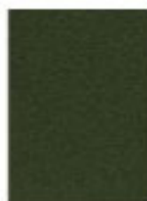
457 moss green DB