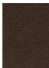
456 dark brown DB