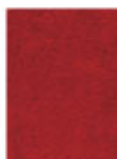
442B medium red