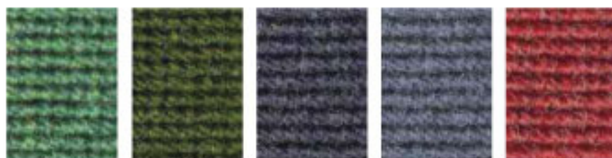
417A light green