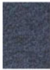
472 grey blue