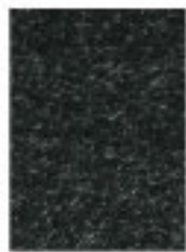
411 Zellwoll velours charcoal