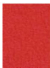
441B light red