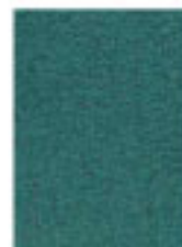
459 turquoise green