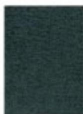
458 pine green DB