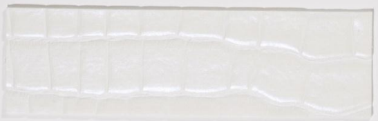
220 x 2877