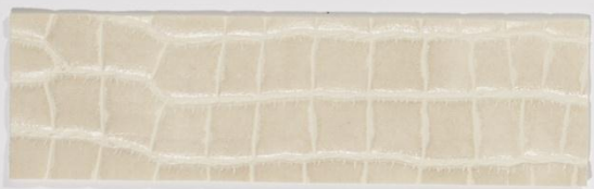
220 x 2875