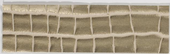
220 x 2873