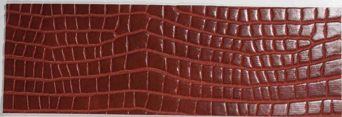
220 x 2870