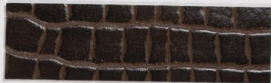
220 x 2872