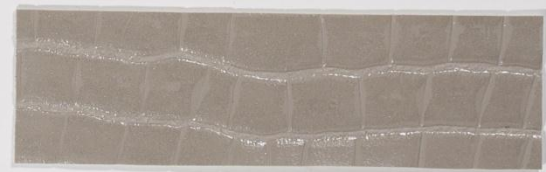
220 x 2876