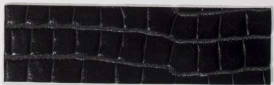
220 x 2878